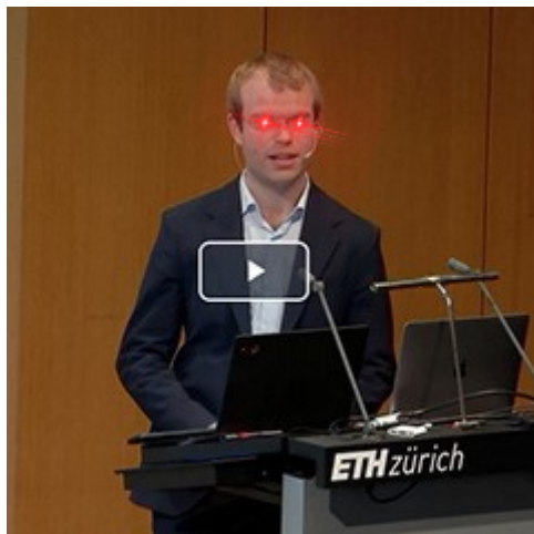
Figure: ETH Hintz