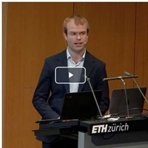
Figure: ETH Hintz