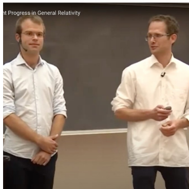
Figure: ICM Hintz