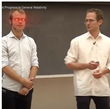
Figure: ICM Hintz